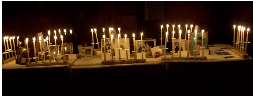
Memory tables display pictures of lost loved ones